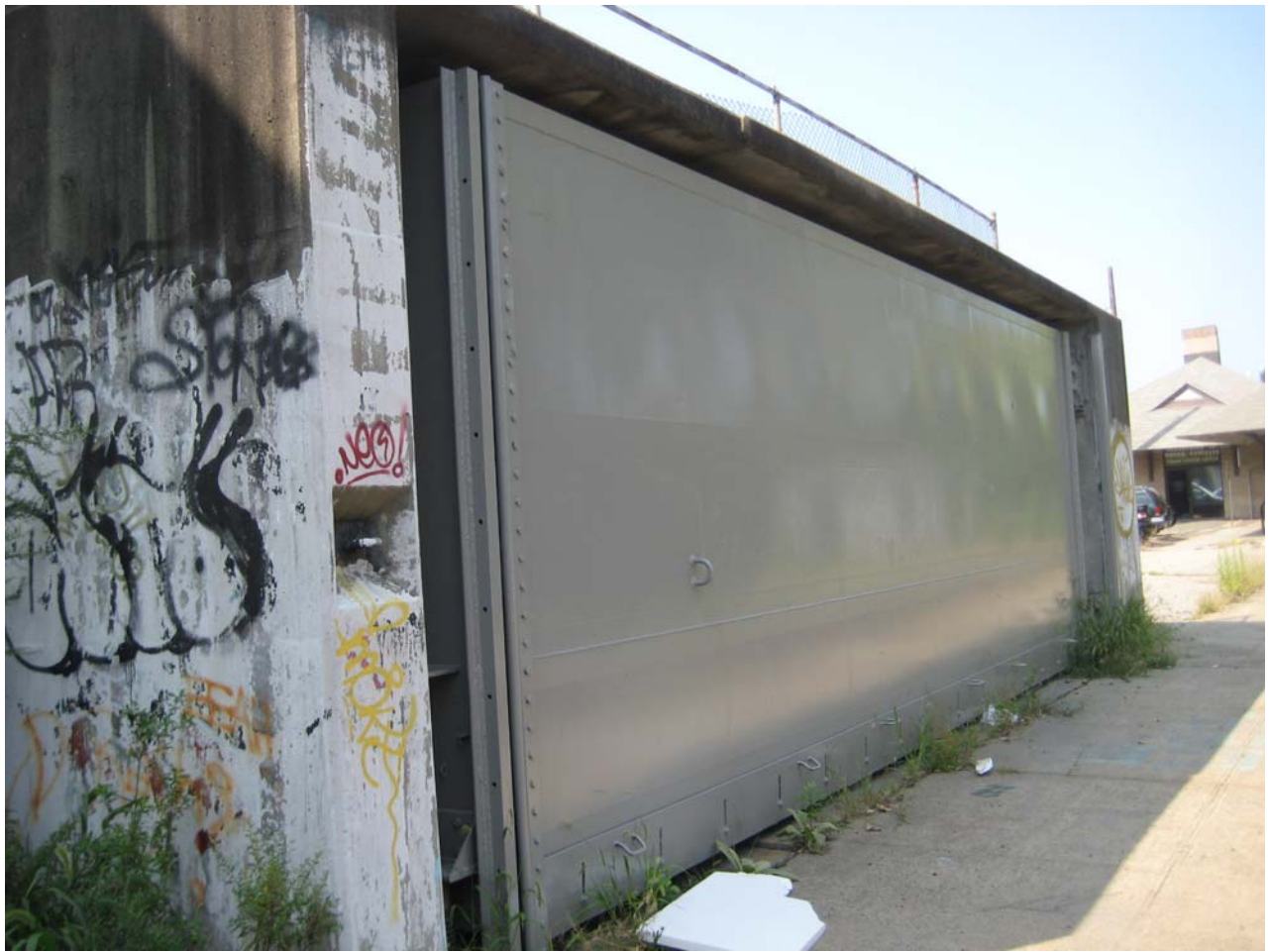
Railroad Flood Gate #1