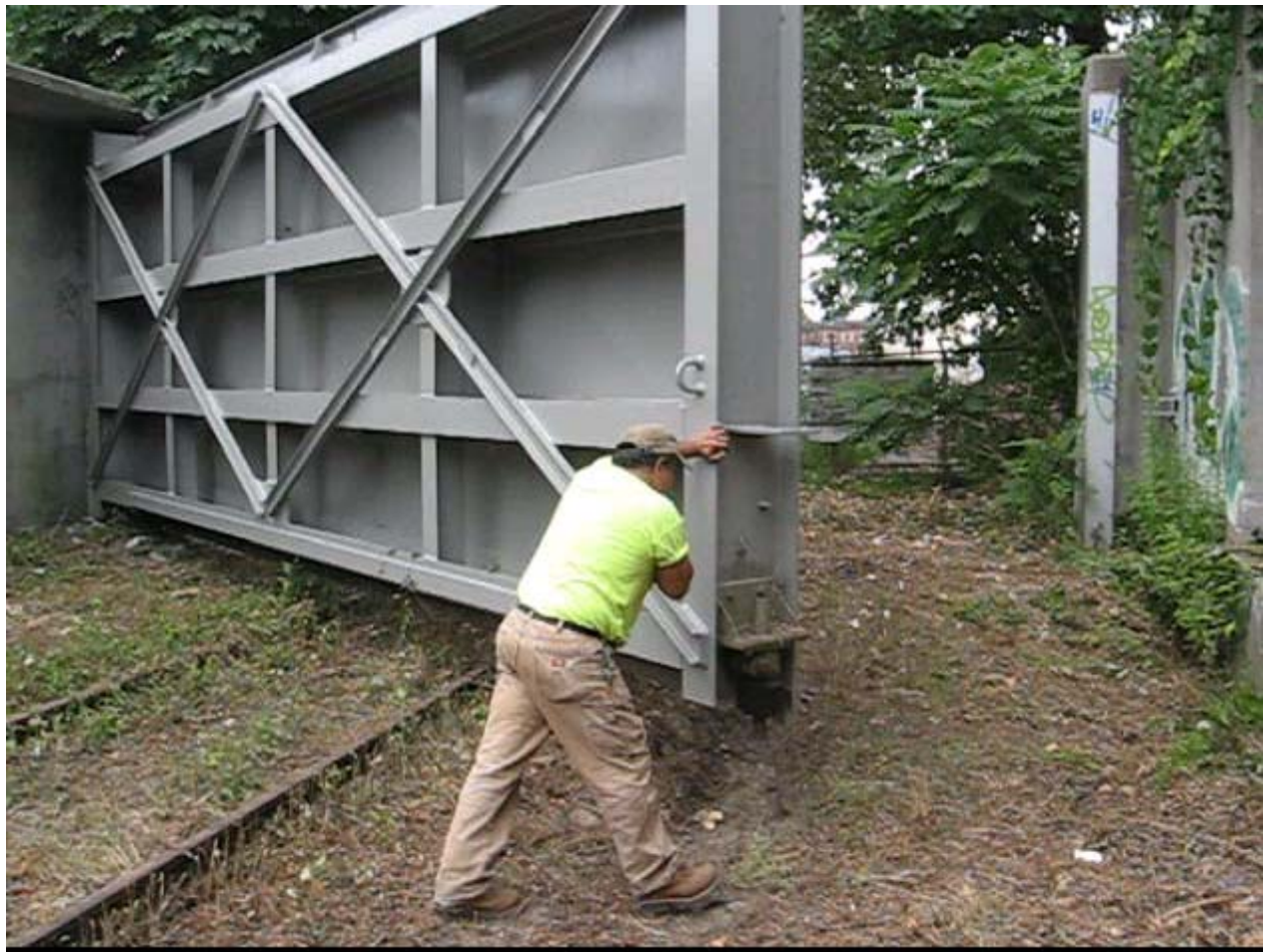
Railroad Gate #2A