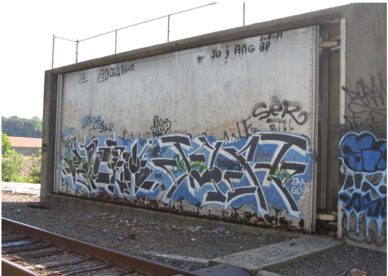
Railroad Flood Gate #4