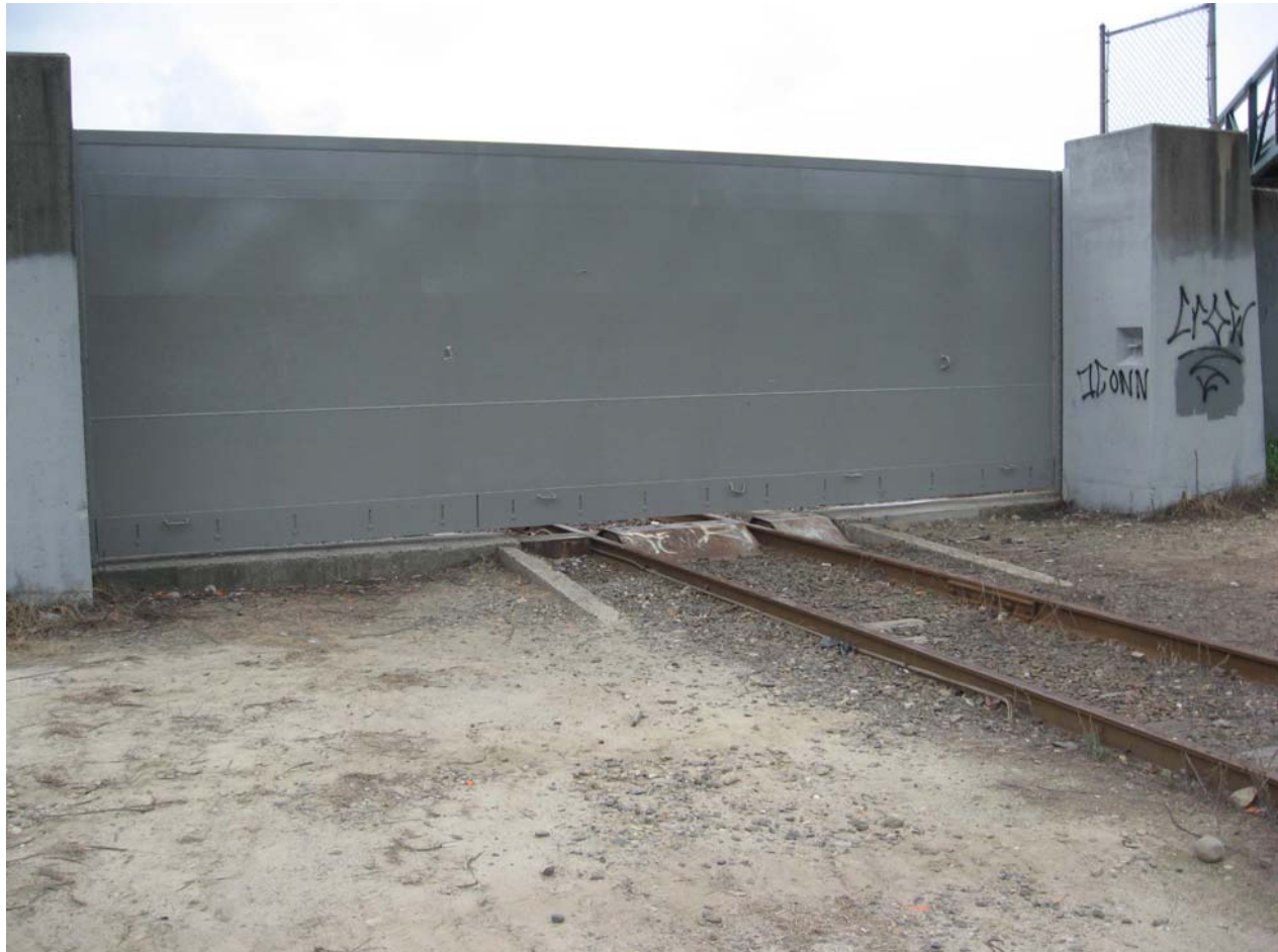
Railroad Flood Gate Structure #3