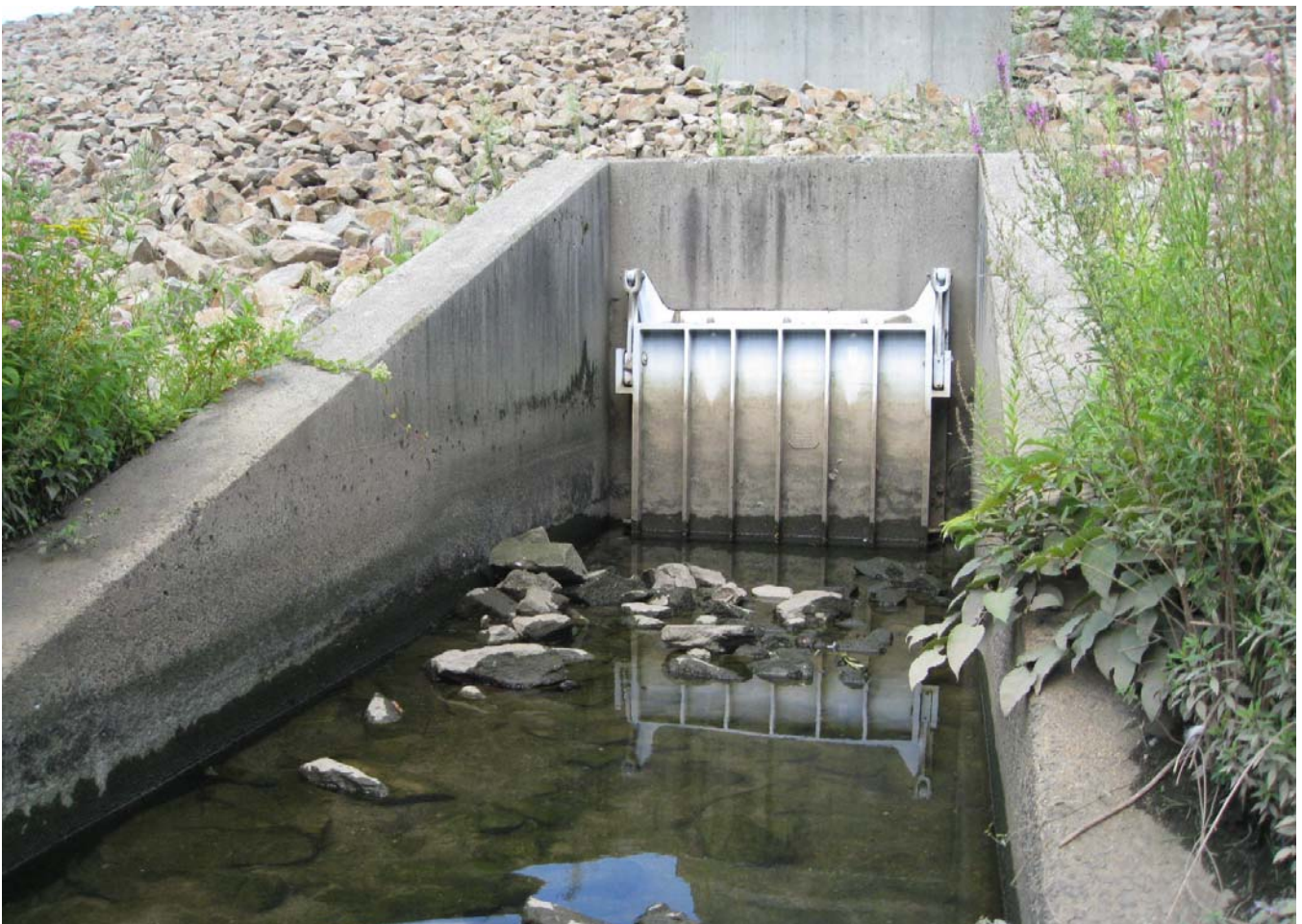
Gravity Storm Drainage Outlet With Sluice Gate Structure #10