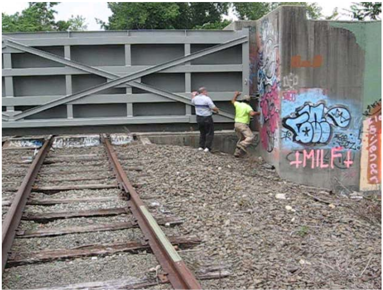
Railroad Gate #2B