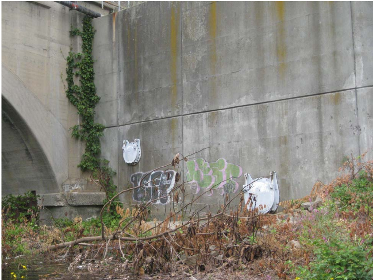
Pressure Conduit Storm Drain Outlet Pipes (Housatonic River)