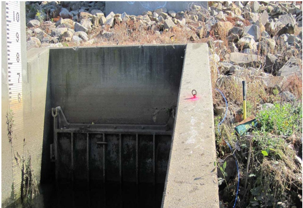
Gravity Storm Drainage Outlet With Sluice Gate Structure #2