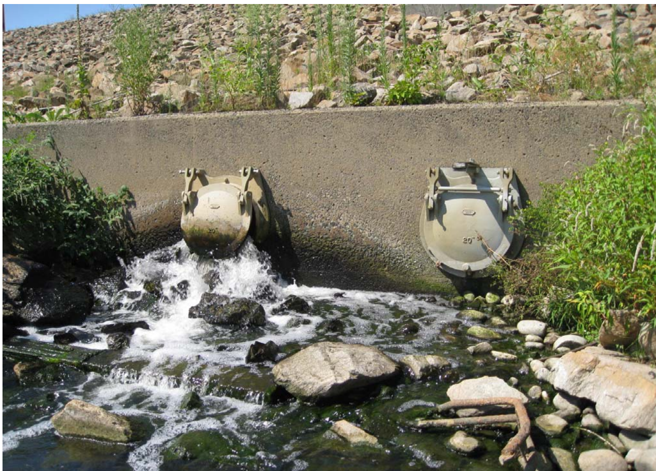
Sanitary Sewer Pipes With Sluice Gate Structure #8