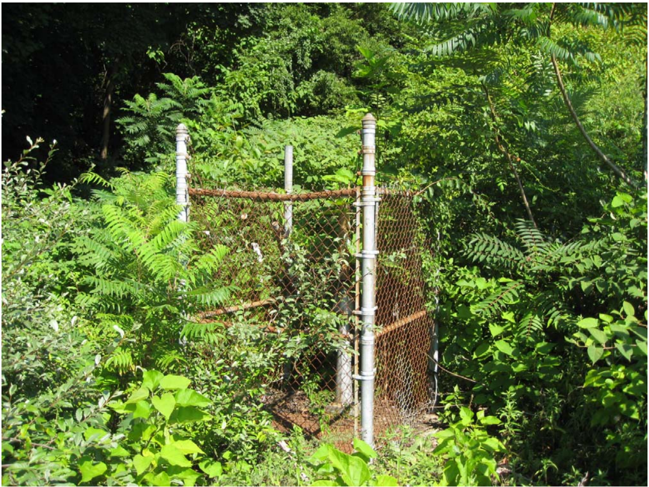
Sanitary Sewer Pipe With Sluice Gate Structure #5 (Vegetation has been cleared)