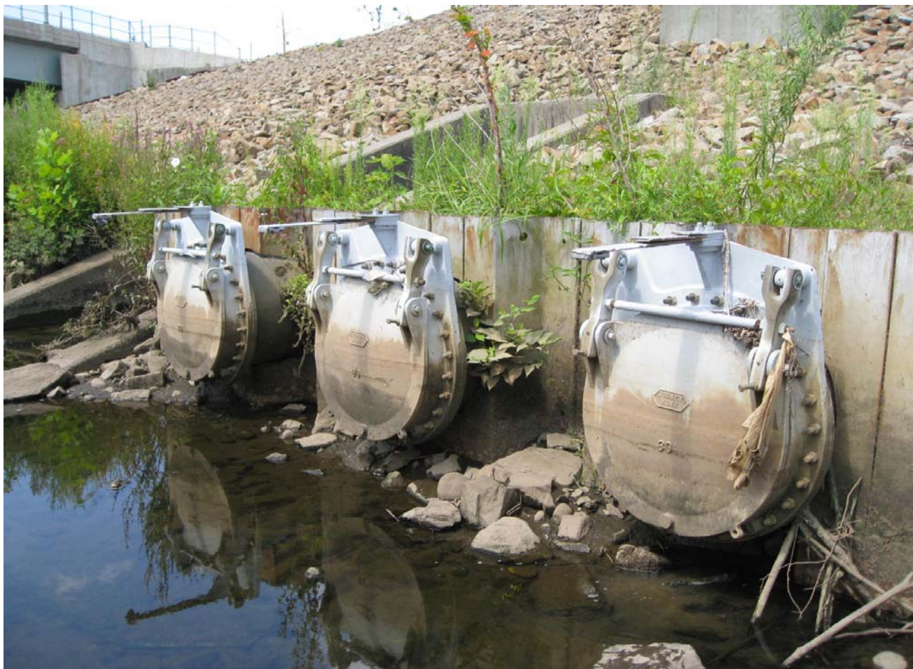
Force Main Discharge Pipes From the Division Street Pumping Station