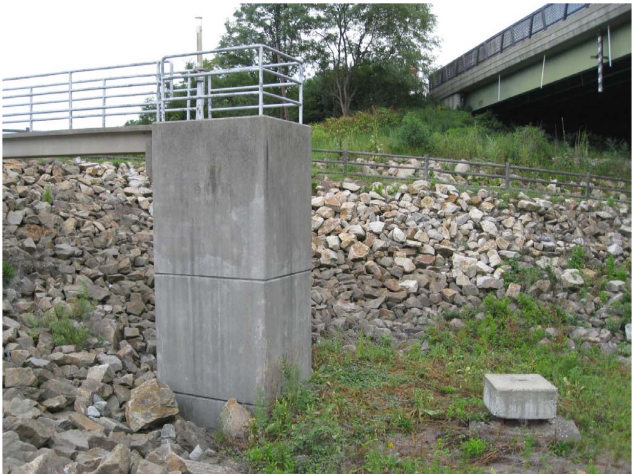
Sanitary Sewer Pipe With Sluice Gate Structure #3