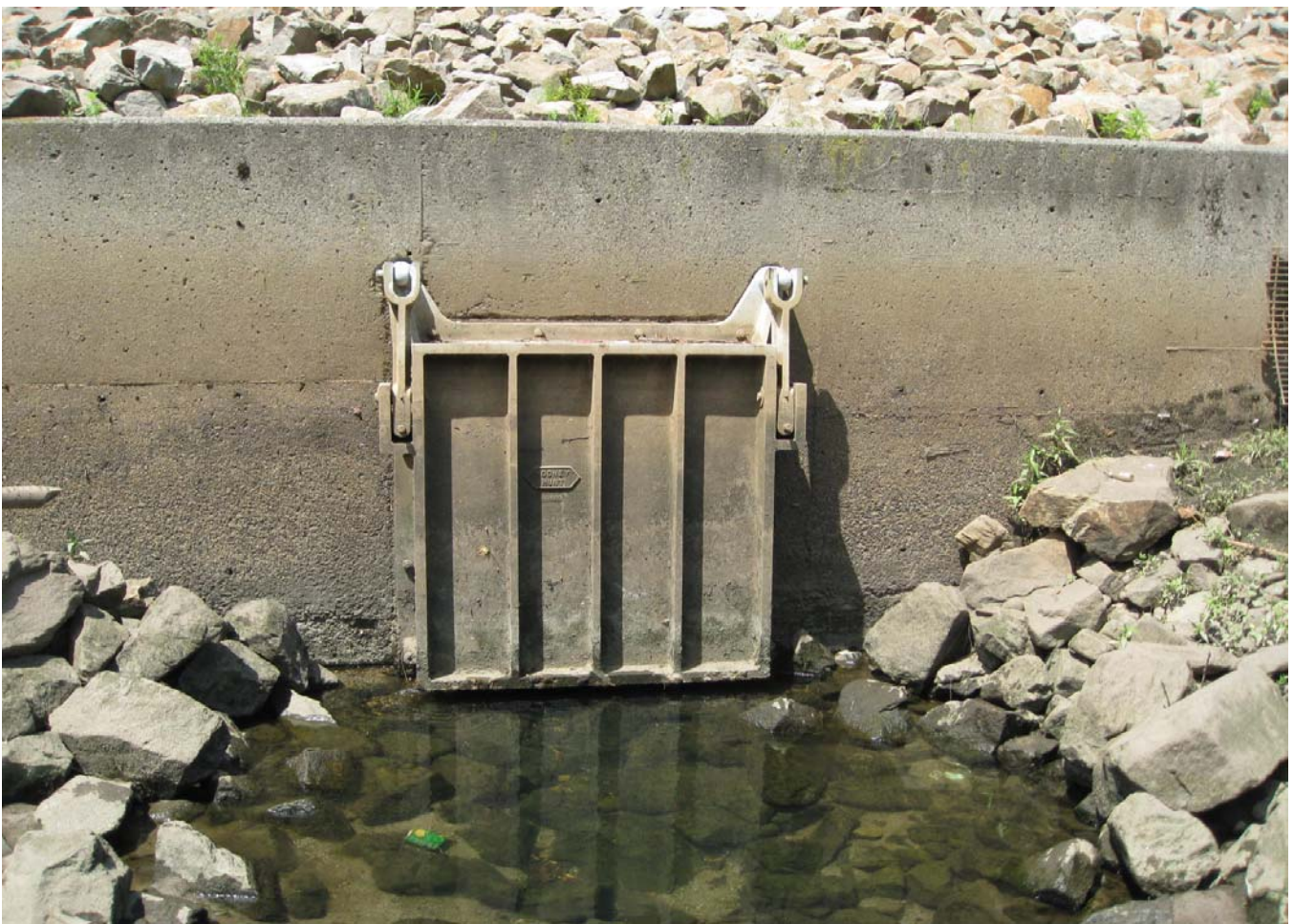
Pressure Conduit Storm Drainage Outlet With Sluice Gate Structure #11