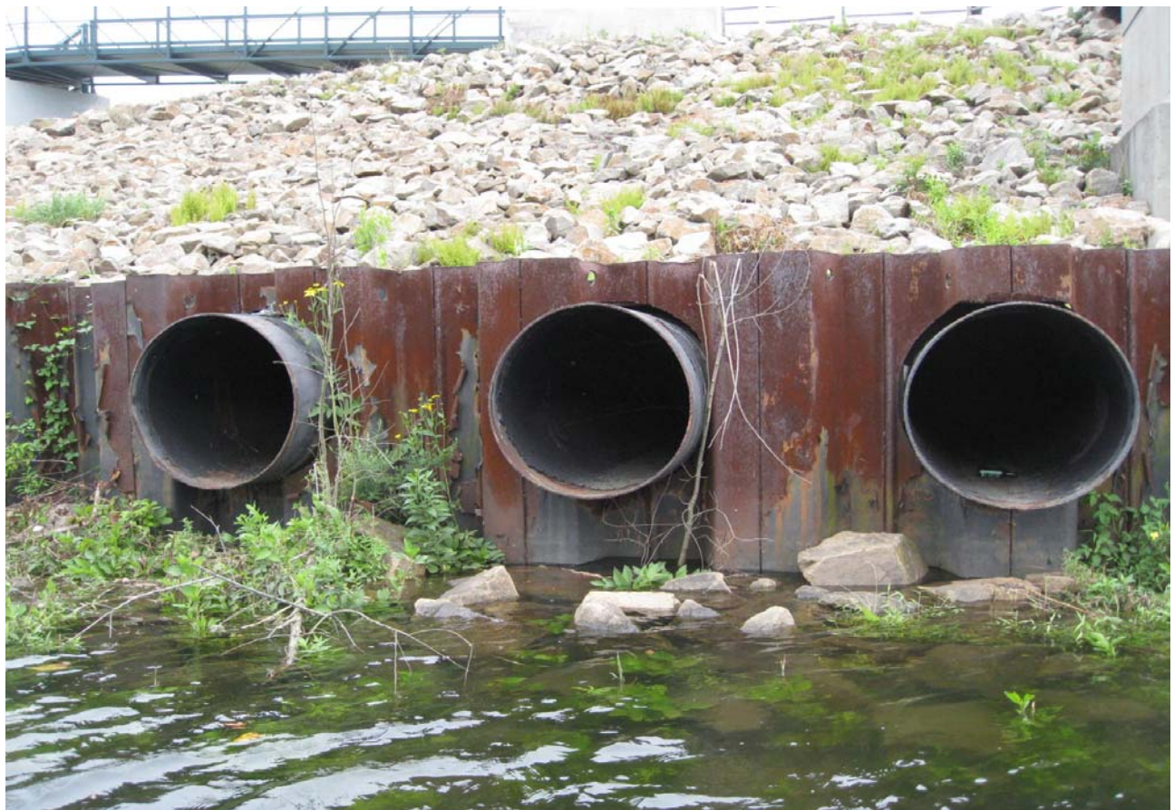
Force Main Discharge Piping From Derby Pumping Station