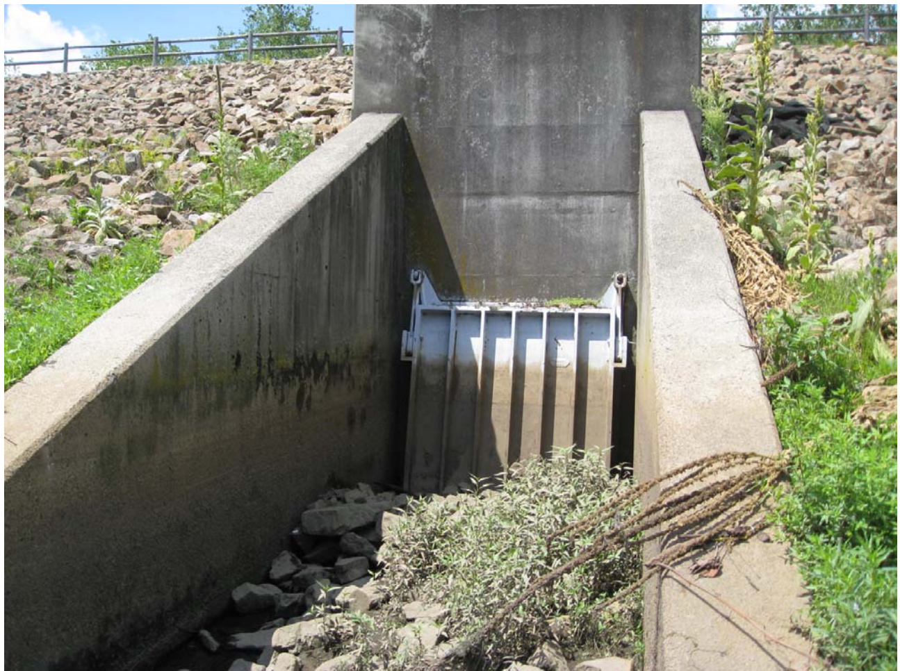
Gravity Storm Drainage Outlet With Sluice Gate Structure #1